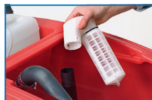
Float with filter