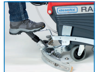
Suction unit and brush head lifting by foot