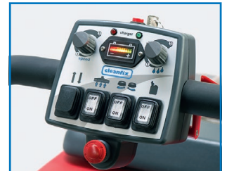
Clearly laid out control panel