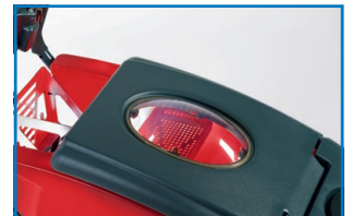
The operator can always see inside the tank