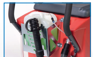
Retainer for 5 litre canister